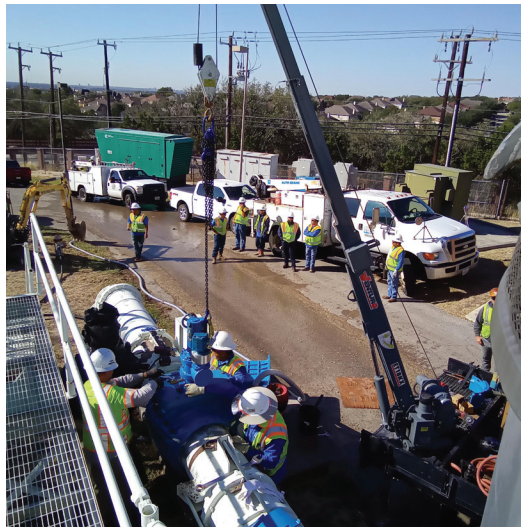
Once in place the EM machine was fitted to the top of the valve.