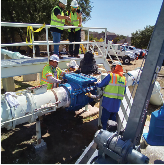
The pipe was prepared to receive the AVT EZ Valve, and the valve body was fit to the pipe.