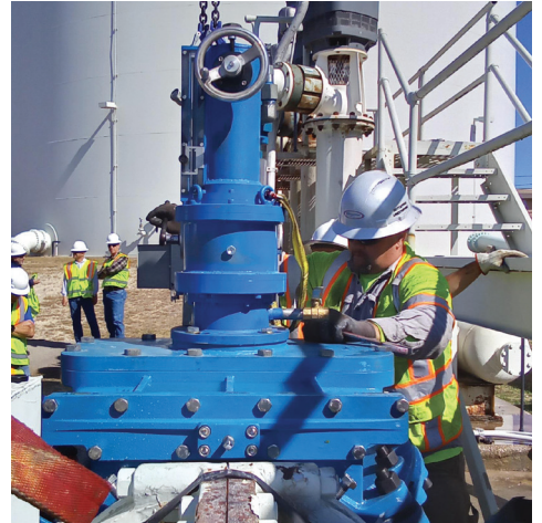
The EM machine was prepared for operation.