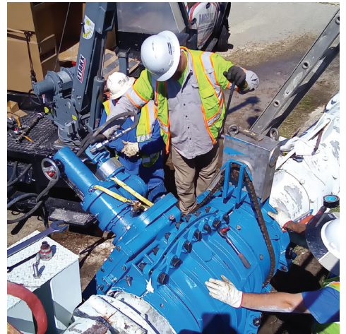
The EM machine then milled a 120° slot across the top of the pipe.