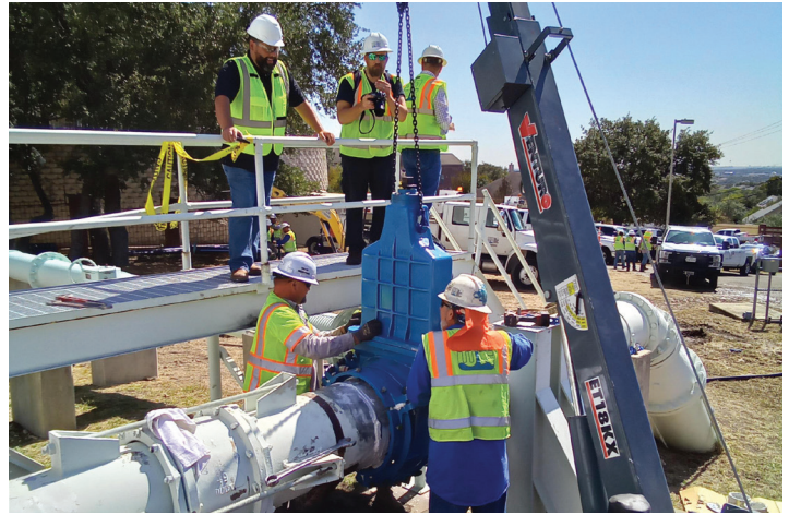
The bonnet was lifted into the valve body and secured in place.